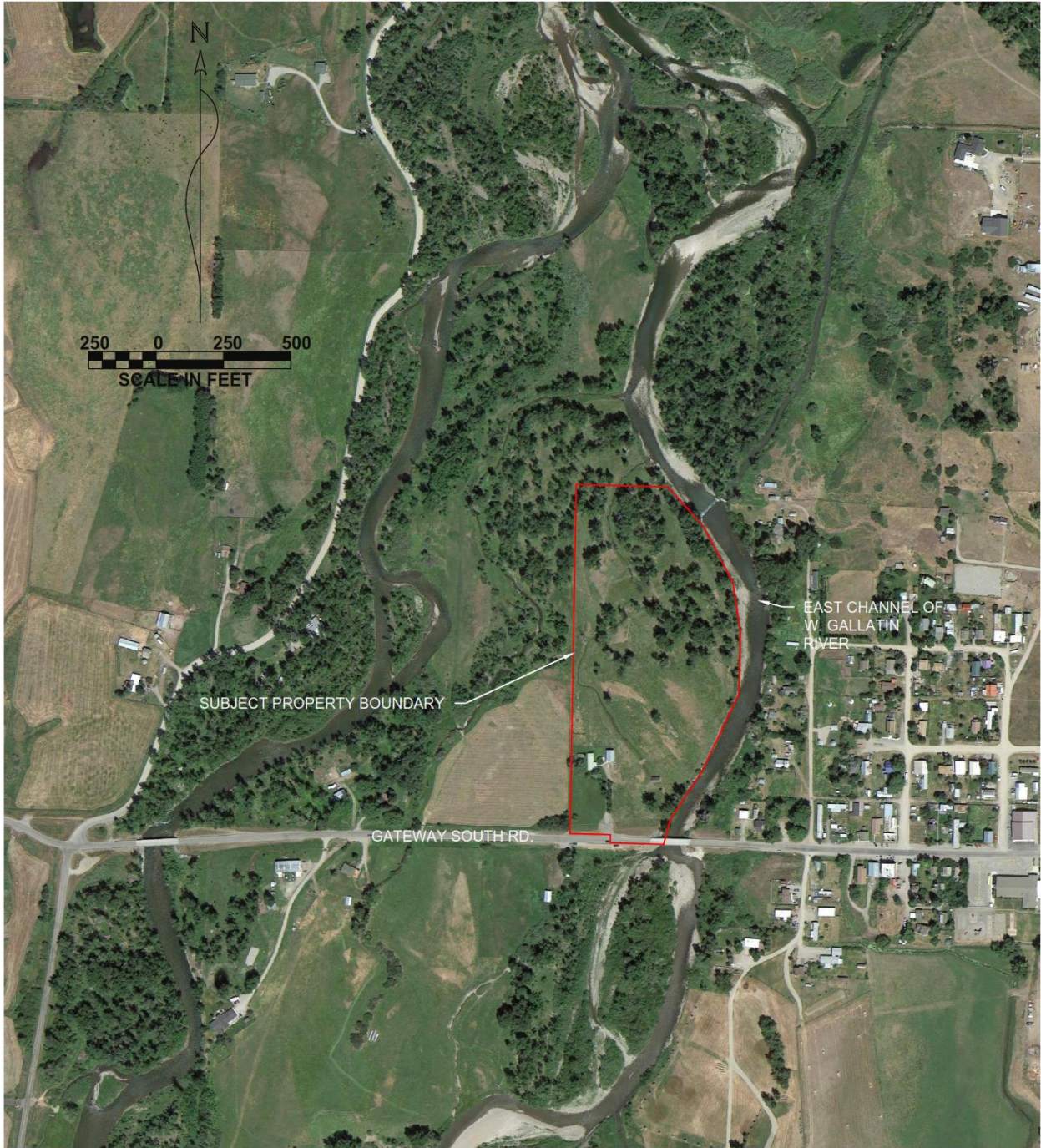
Figure 2: Aerial Photo of Site from 2014