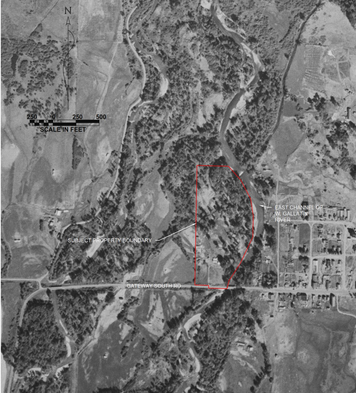
Figure 1: Aerial Photo of Site from 1945